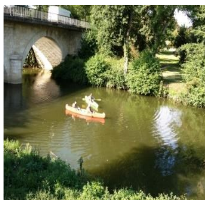
Privative bank for fishing and kayaking

In the heart of the Bergerac vineyards, we welcome you in our renovated air-conditioned cottage, in the superb bastide of Eymet.